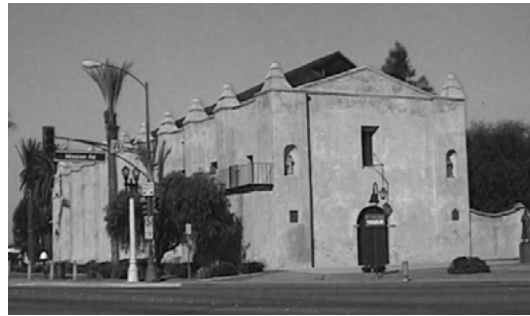
San Gabriel Mission (f. 1771)