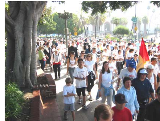
Congratulations, walkers — you've arrived!