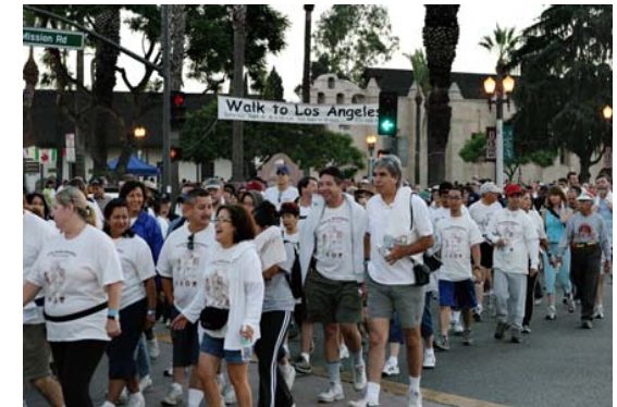
Walkers leave San Gabriel for Los Angeles.

Los Angeles & San Gabriel Sharing a Living History